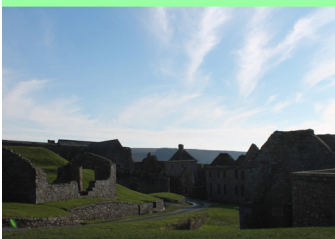
Charles Fort in Kinsale, another star fort in Ireland.

Beyond a physical difference of history in the land and cityscape, there is a cultural difference as well. People carry their history in a very personal manner. The story of their city, their town, their country is the story of their family and themselves.