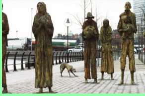
The Irish Famine Memorial in Dublin.

He spoke with such genuine anger and sadness about events which took place over a century and a half ago that I was almost certain he must have lived through them!