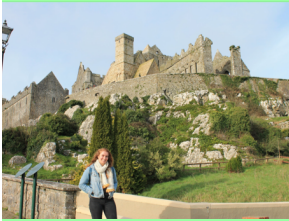
Rock of Cashel in County Tipperary.

Ireland is not a big place. It is made smaller by the way everyone seems to know at least something about someone else. That being said, it feels a place deeply concerned with the local. Everyone is loyal to their local sports teams, indeed the goal for many young Gaelic football players is to represent their county in the annual All Ireland Final. Neighbors stop in for a cup of tea and chat about local gossip. Even in a city like Cork, the second largest in the Republic, there was a real sense of unity.