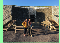
Outside of Newgrange, a neolithic passage tomb in the Boyne Valley in County

Overall, my experience made me realize how little I feel connected to my own history. I have a vague understanding of my family's ancestry and a slightly better comprehension of American history, but I don't necessarily know how to synthesize the two. My time in Ireland opened my eyes to the way history can be presented beyond facts about the past, but in an emotional and personal way.