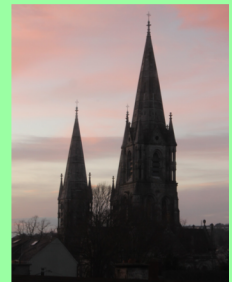
St FinnBarre's Cathedral from my window.

Further along the road is Elizabeth Fort, a star-shaped structure which housed the English forces. The barracks inside the fort are what give the street its name. Built in 1601, it originally marked the southern entrance into the walled city centre of Cork. Today it functions as a free museum, complete with exhibitions modeling 17th century punishment from a pillory to spikes with fake heads. Across the street is the Coach House, originally constructed in 1701. Today it houses the local grocer and became a frequent stop for me after class to grab a sleeve of biscuits.