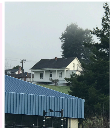
Phillips House Museum on a recent misty winter morning