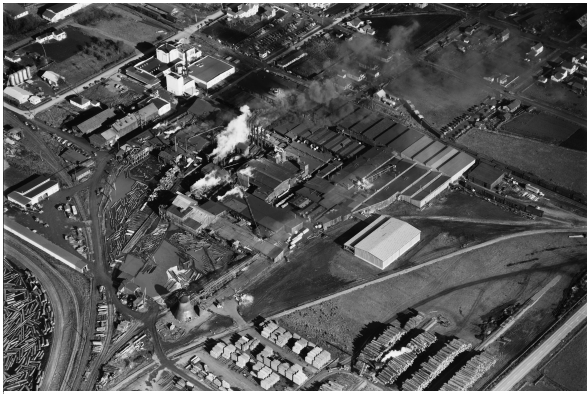
CA Barrel Factory

The potatoes that washed away down Daniels Slough were probably the “Humboldt Red” variety, a commodity that reportedly made “several fortunes” in the Arcata area from 1868 to 1870. The fertile lands of the Arcata